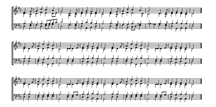
Raymond Whorley et al., Harmonizing Melodies: Why do we add the bass line first?, 2013